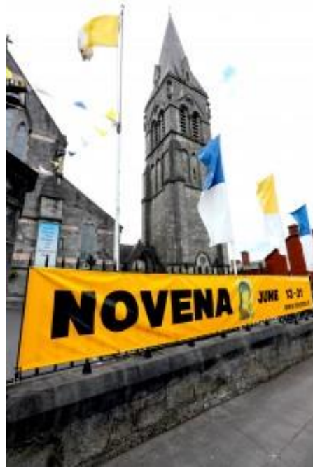
Church entrance decorated for the novena